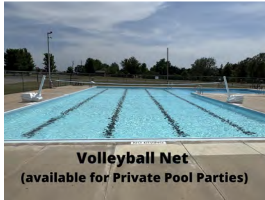
Volleyball Net (available for Private Pool Parties)