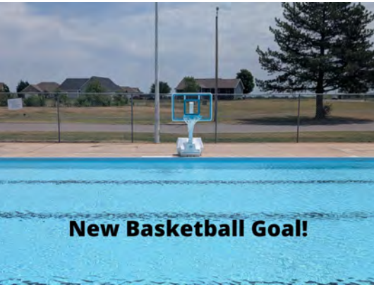
New Basketball Goal!